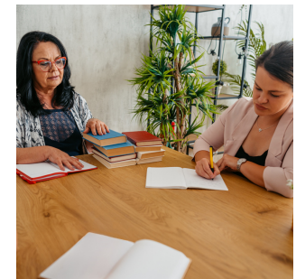
Emergency Rental and Utility Aid

Over the past 50 years, WVCS has remained a steadfast pillar of community support. This 50-year milestone isn't just a celebration, but a reminder of a community's power to unite against hunger and homelessness.