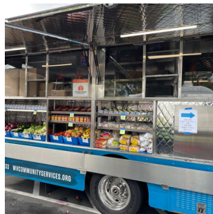
Park-it Market (mobile food market)