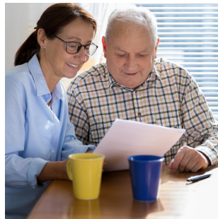
Case Management and Referrals