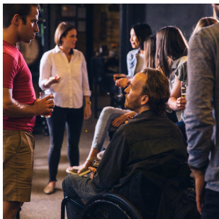
Lived Experience Advisory Committee