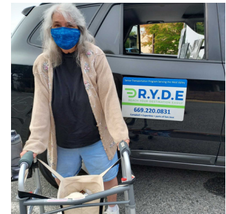
Reach Your Destination Easily (RYDE)