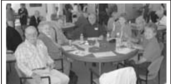
Volunteers chat and enjoy catching up before dinner was served.

Each volunteer is essential in the operation of CCS. Every volunteer job is interdependent on each other, and is vital to ensure that CCS provides quality services. The quality of volunteers directly relates to CCS programs and services. Volunteers, you truly are an essential piece and every aspect of your personality that you bring to your job is just as important as the job itself. Thank you is simply not enough!