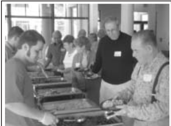
CCS volunteers are served delicious food by Outback Steakhouse staff.